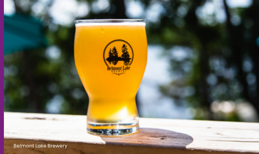
Belmont Lake Brewery

Working collaboratively on culinary tourism development involves fostering connections within the industry. This goal must be addressed so as to maximize industry benefits and contribute to building trust amongst all parties. Stronger connections within the culinary tourism industry will support all of the areas of opportunity described. As such, it can take on many forms, from creating physical spaces or moments of connections to supporting industry communications and fostering opportunities for collaboration.