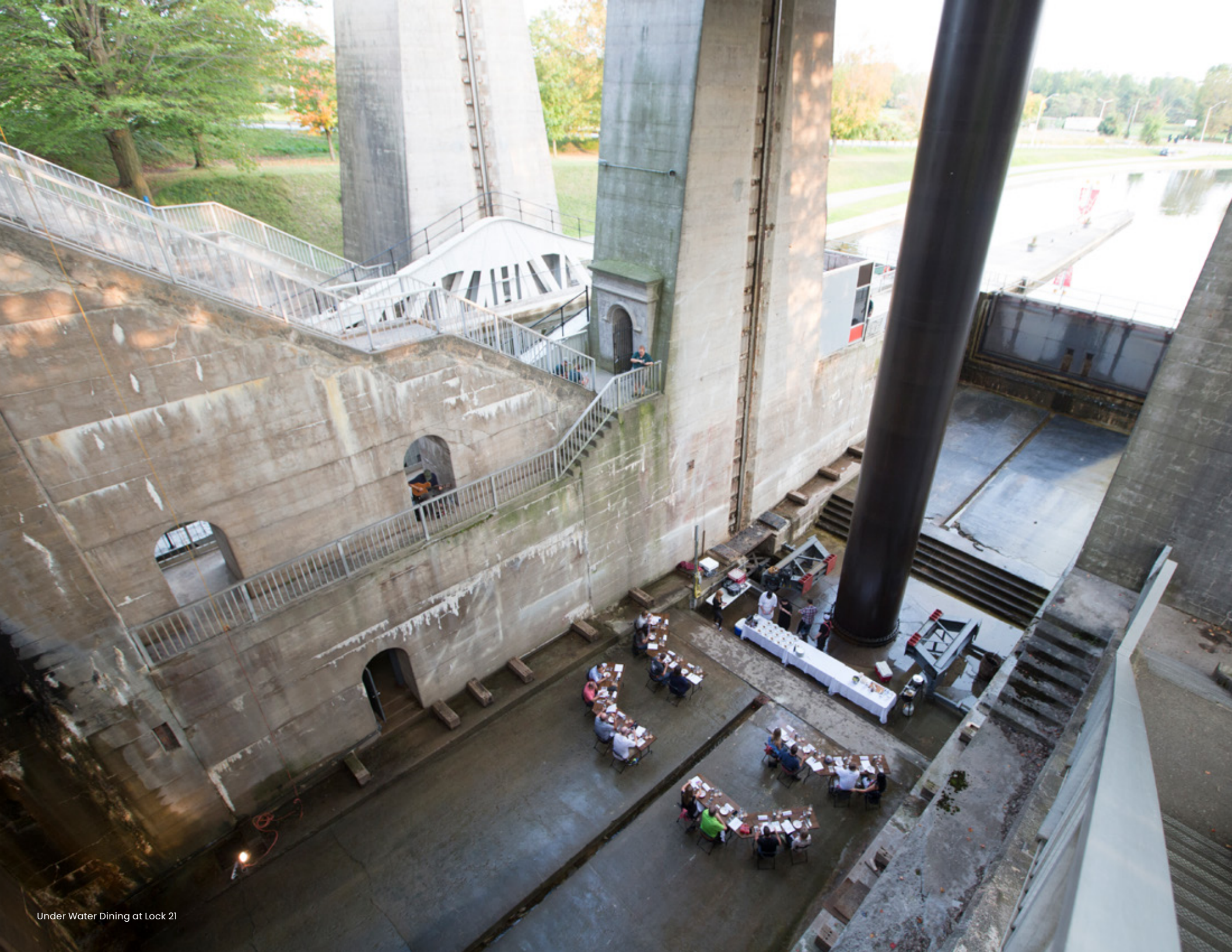
Under Water Dining at Lock 21