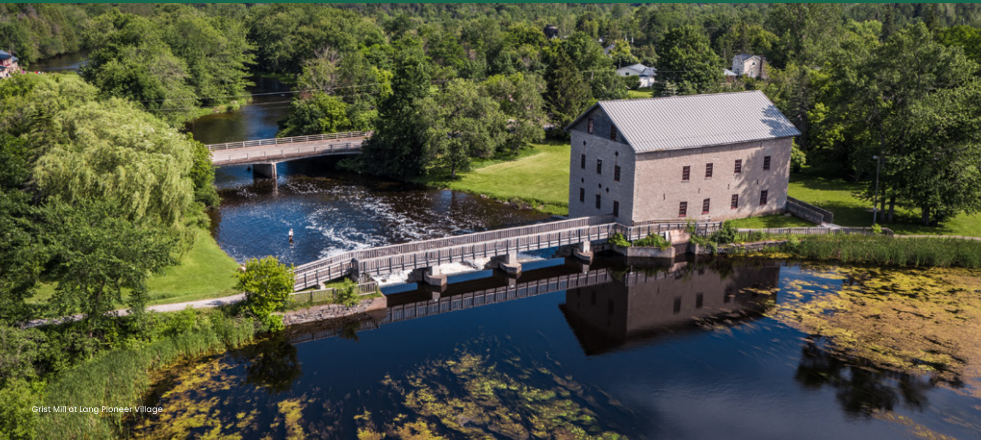
Grist Mill at Lang Pioneer Village

Other forms of alternative tourism, such as rural tourism, ecotourism, cultural tourism, Indigenous tourism, and outdoor tourism can be connected to culinary tourism through experience development. 1 For instance, in Peterborough & the Kawarthas, visitor attractions such as Petroglyphs Provincial Park, Kawartha Highlands Provincial Park, Trent-Severn Waterway National Historic Site of Canada, Lock 21-Peterborough Lift Lock, the Lang Pioneer Village Museum, and the Canadian Canoe Museum can all be elevated through food and drink.