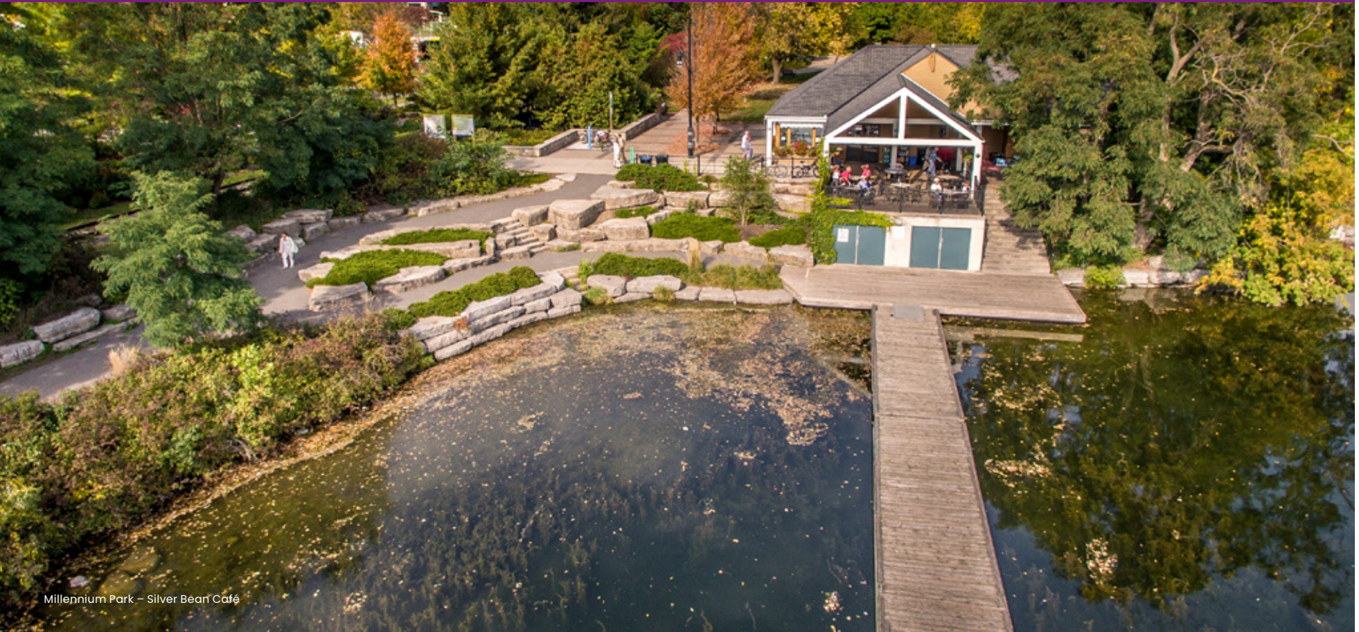
Millennium Park – Silver Bean Café

Through the strategic planning session, four primary areas of opportunity were prioritized, and each area of opportunity was paired with related actions to support culinary tourism development in Peterborough & the Kawarthas. In total, 15 actions are recommended. These are mapped out over a 3-year implementation timeline, as seen in the Strategic Framework. Each area of opportunity is presented below along with relevant context.