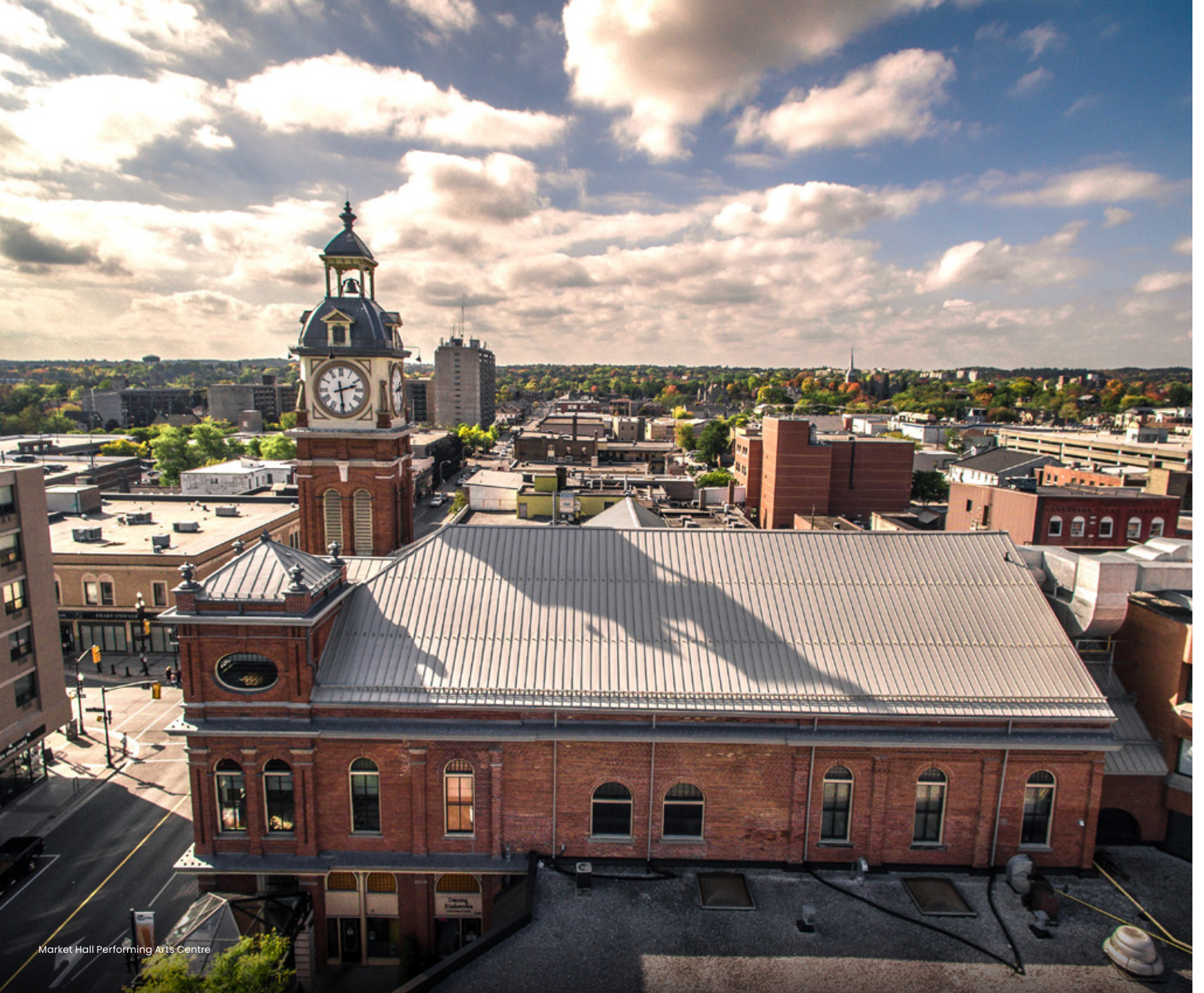
Market Hall Performing Arts Centre